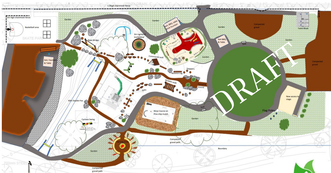
Cunderdin O'Connor Park layout Concept

The next step in the park redevelopment project is the youth consultation session, which will determine the skate park layout and design.