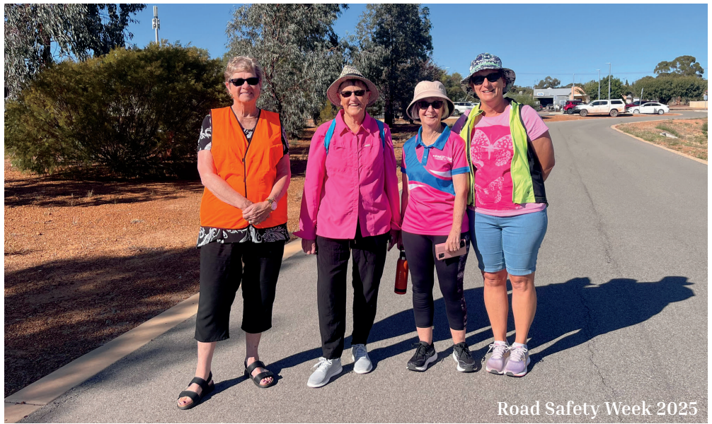
Road Safety Week 2025